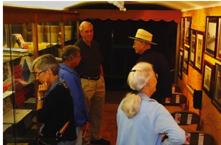
Brunk trailer opens its doors to the museum inside.