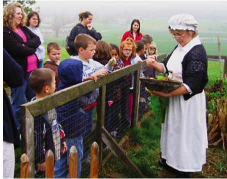
Plains and Pleasant Valley Elementary School students learn about gardening.

Field Trips brought hundreds of students, teachers and parents to the campus to learn how life used to be lived in the Valley. Four elementary schools visited the campus in the spring and eleven schools were scheduled for field trips this fall. ♦