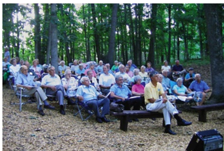
A new amplifier can be seen in the foreground.