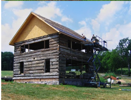
Above is the Weaver-Brunk Log House as it took shape over the summer months.