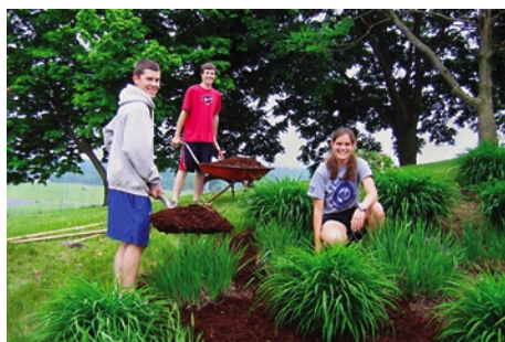
EMHS students are mulching beds on May 13, 2011.

Springtime brings renewal, making it a grand time to clean up winter debris and plant flowers. Two groups of youth left their mark on the campus this spring. First, a group of eight students from Eastern Mennonite High arrived on May 13 to rake the amphitheater, chip the path to it, mulch shrubbery and clean buildings. Then a junior high work camp on June 25 planted flowers donated by Mistimorne Plants and Woodland Plants. Thanks to these and others who lent their time and energy to beautify the campus. ❖