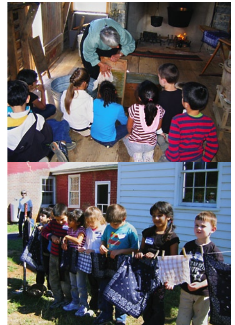
Students experience hand-washing.