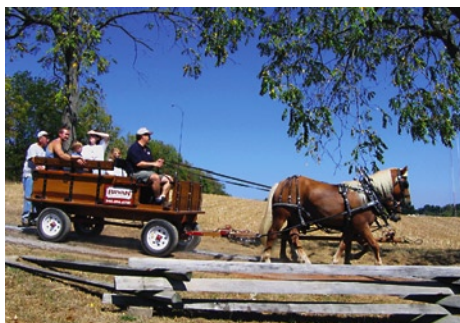
Carriage rides during Harvest Day September 25.