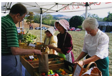
Visitors enjoy the Harvest Day produce stand.