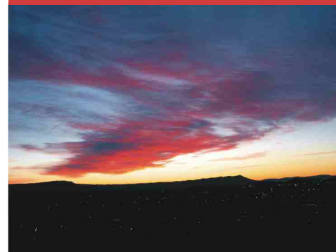
Sunrise view from CrossRoads