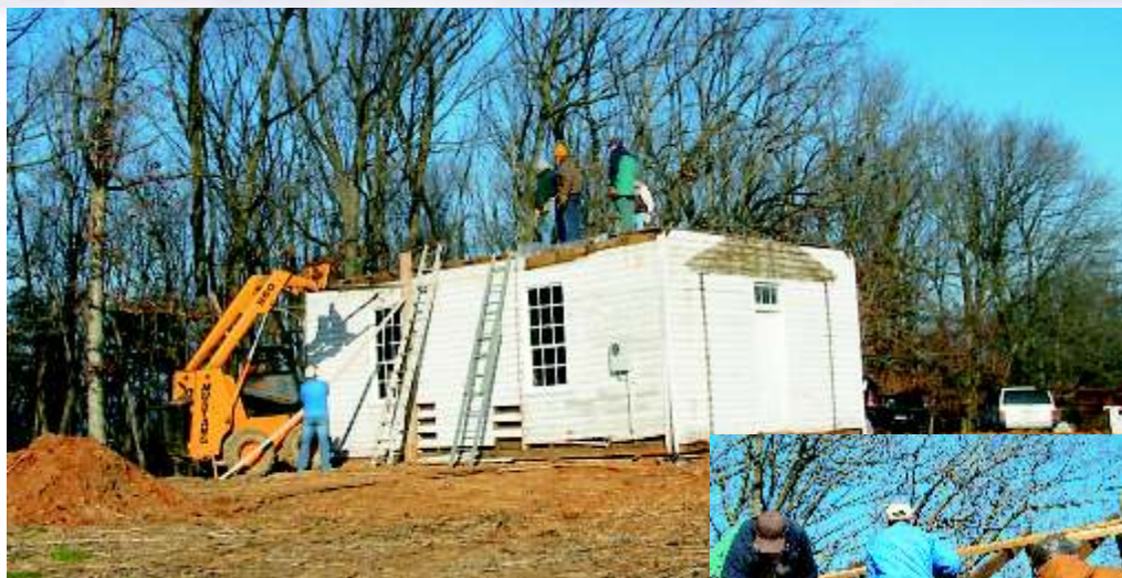
Volunteers reassemble the Whitmer Schoolhouse at CrossRoads, near the woods overlooking the Valley.

▶ Harvest Day 2005. The second annual Harvest Day event has been set for Saturday, October 15. Mark your calendar now and plan to attend this family-focused festival.