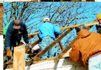
Tom Sawin Photos

After volunteers dug and poured a concrete foundation on top of the hill near the woods, the building was reassembled including use of the old rafters, and the roof was covered with tarpaper and the gable ends weather boarded. The front porch and bell tower will soon be reattached, and metal sheeting put on the roof.